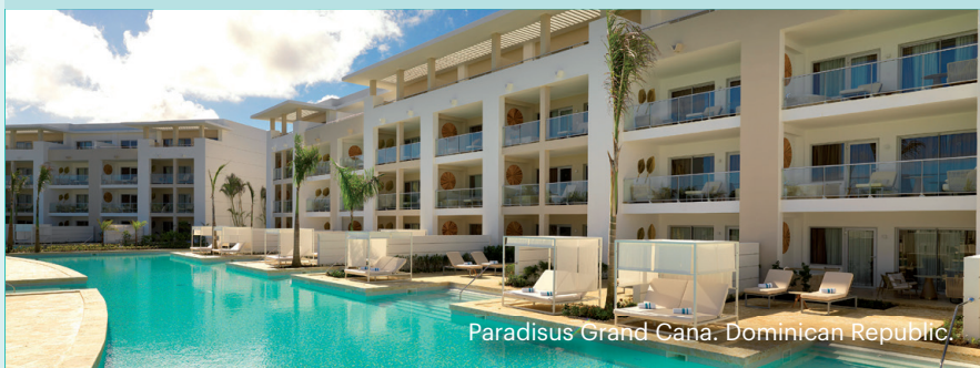
Paradisus Grand Cana, Dominican Republic.

1 The value of points when redeemed depends on each partner. This is just an example. All the redemption values are published in the area for logged-in users on meliarewards.com and in the hotel points of sale.