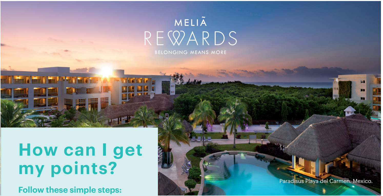
Paradisus Playa del Carmen, Mexico.